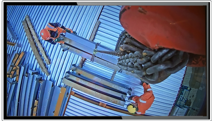
Image of the BlokCam being projected on to a TV in the project office via the BlokCam Office Link